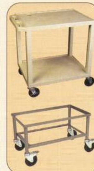
620 + 520