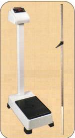
824/BMI Height Measure